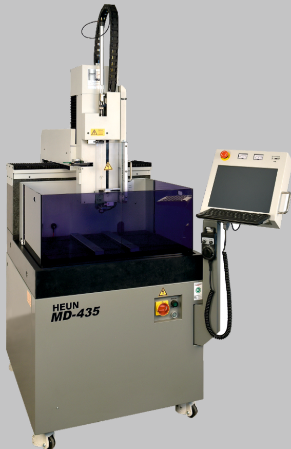
view example MD-435 CNC with electrode changer

As a specialist in the field of EDM drilling , Heun offers the all-round package from development and perfecting, as well as manufacture and delivery, up to service.