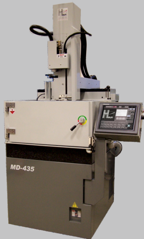
view example MD-435 CNC with oil basin

As a specialist in the field of EDM drilling , Heun offers the all-round package from development and perfecting, as well as manufacture and delivery, up to service.