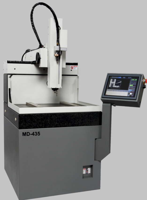
view example MD-435 CNC

As a specialist in the field of EDM drilling , Heun offers the all-round package from development and perfecting, as well as manufacture and delivery, up to service.