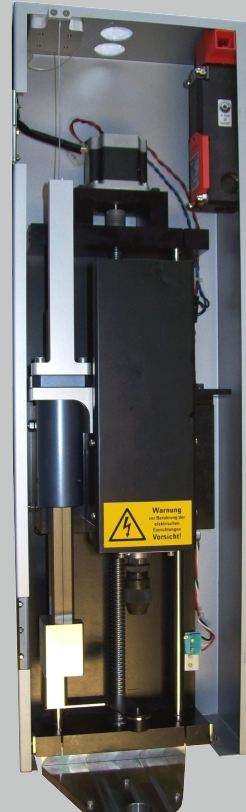
view example electrode stabilisation

As a specialist in the field of EDM drilling , Heun offers the all-round package from development and perfecting, as well as manufacture and delivery, up to service.